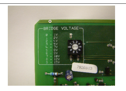
PCB mounted Bridge Voltage setting control (set to 1V)

Once the correct voltage has been decided upon, the excitation voltage control can be set by inserting a flatbladed screwdriver into the white "arrow" slot and rotating to the correct number. Note that the voltage is generated symmetrically about zero i.e. Position 3 (5V) is ±2.5V.